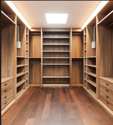
Built - In Closets