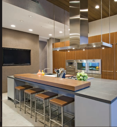
Modern European Style Kitchens