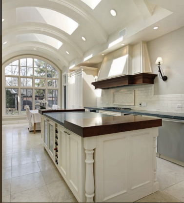
Traditional Face-Framed Kitchens