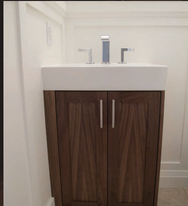
Custom Made Vanities